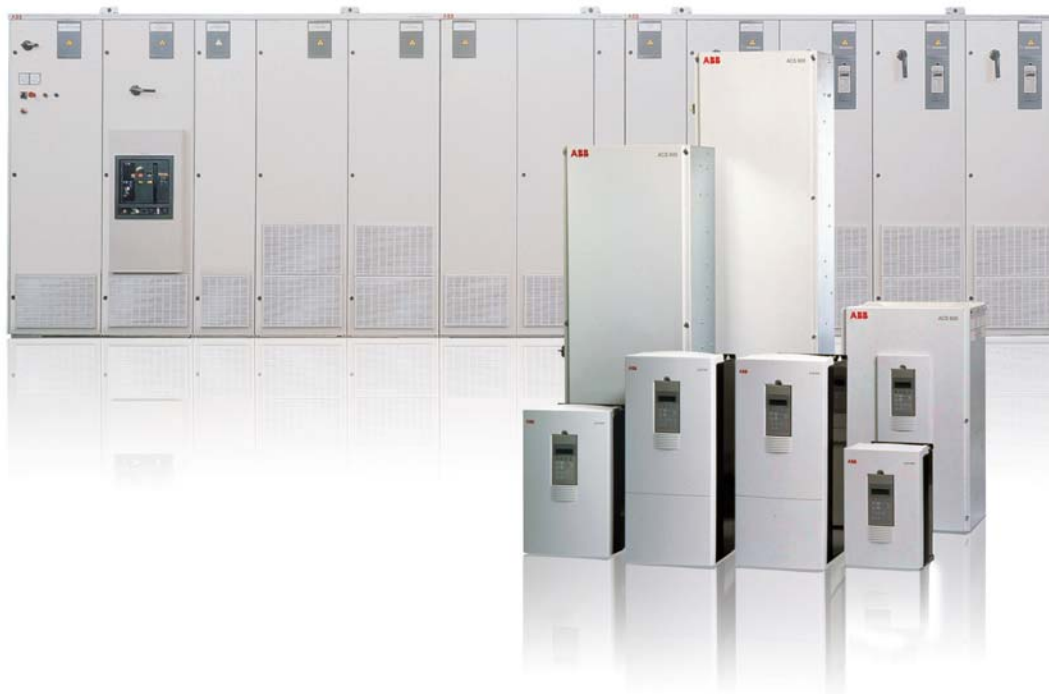
ABB recommends its preventive maintenance and reconditioning services to help control and cut operating costs associated with its drives. On-site preventive maintenance is designed around drive maintenance schedules and significantly reduces the risk of failure while increasing the lifetime of a drive. Reconditioning in an authorized ABB drive service workshop should be considered when major components need replacing according to the maintenance schedule. Both services contribute to higher reliability of the installed plant which in turn helps maintain high productivity.